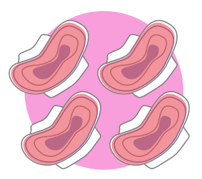
Severe bleeding such as 4 full pads in 2 hours